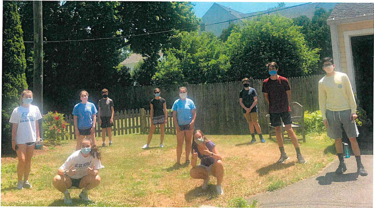
"Participants in our Youth Mission Challenge in June"