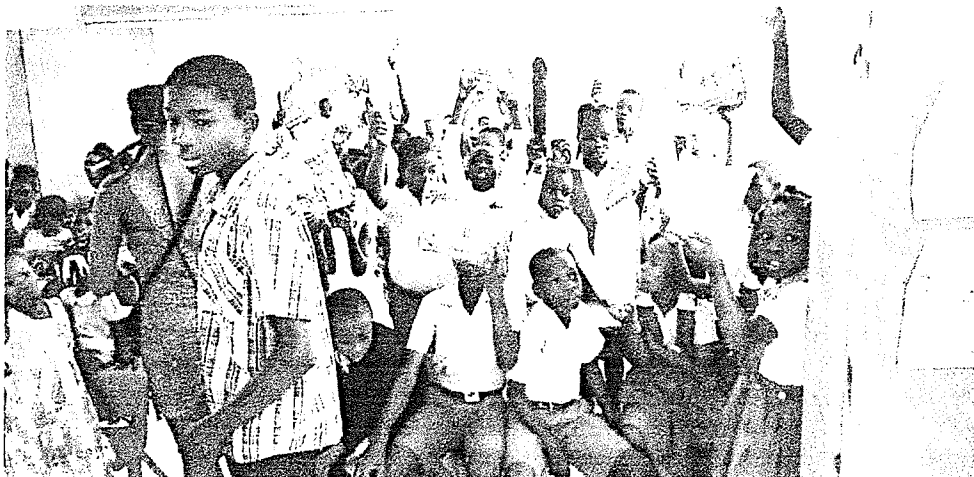
The Haitian Congregation of the Good Samaritan, and individual donors contributed money for Christmas gifts for the children of Martel.

Perhaps our biggest challenge was the currency exchange rate. In October the Haitian government rendered American dollars to be nearly half the value they were in September. This meant that the money we wire to Haiti every month no longer covered the payroll for the teacher salaries. The planned expansion of the school to seventh grade could not happen; those fifteen students went to other schools. We were able to send a little more money than usual each month, but it was short. Since October, the exchange rate has returned to around 65% of what it was last summer.