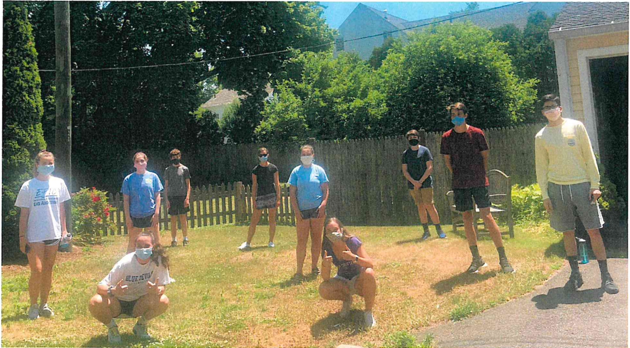
"Participants in our Youth Mission Challenge in June"